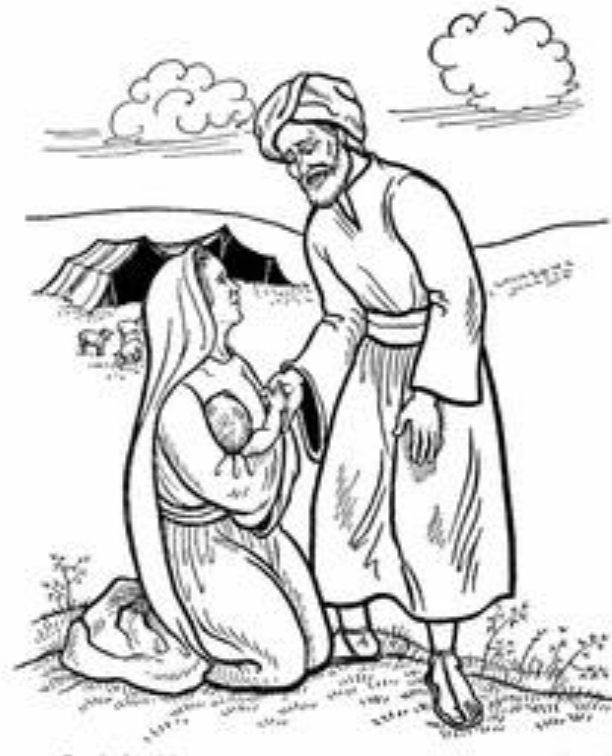
In their old age, a son was born to Abraham and his wife, Sarah. He was named Isaac.